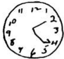
Mild Cognitive Impairment (Numbers error and placement of hands) Score 8