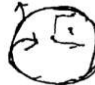
Severe Cognitive Impairment Score 2