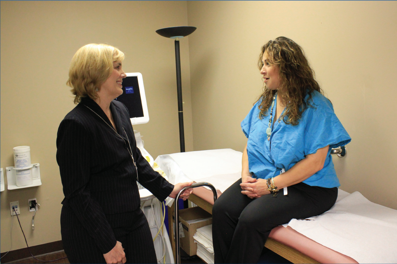
MedStar Montgomery Medical Center assists the uninsured in establishing a medical home through ED/PC Connect. Emergency department patients are provided counseling upon discharge and assistance in making appointments with one of the many local free/low-cost area clinics.

Nearly 12 percent of Montgomery County residents are uninsured .