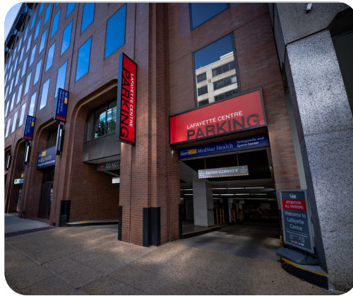
20th Street garage entrance