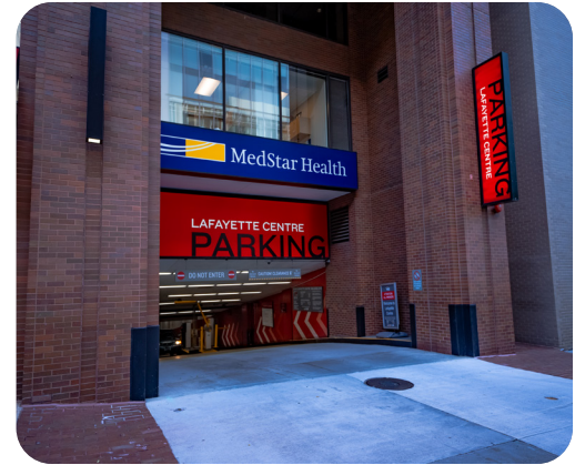
21st Street garage entrance