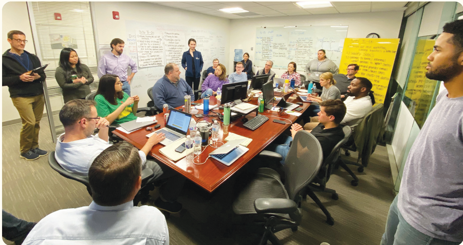
MI2 colleagues worked during the initial days of redeployment in mid-March, to ramp up MedStar telehealth. This photo was taken prior to the workplace requirement for proper PPE and physical distancing. All patients and providers are expected to follow the current MedStar Health guidelines for safety. Learn more at MedStarHealth.org/Safe .

providers who continued routine telehealth visits with her patients as the shelter-in-place was underway. She says telehealth has been good for her and her patients.