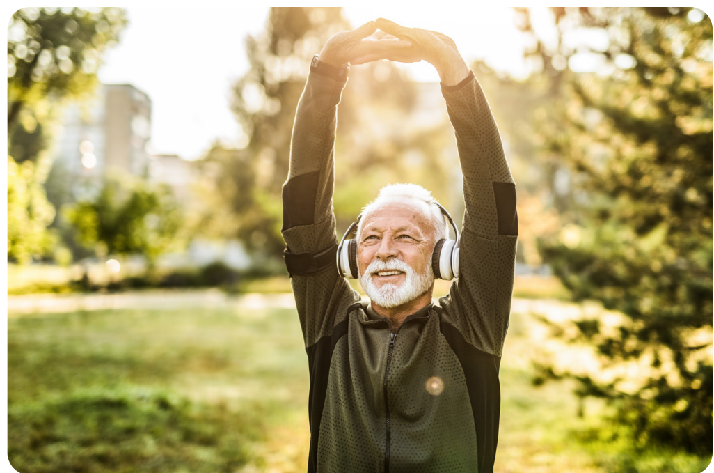
Before you start exercising, warm up with gentle movements and stretches.