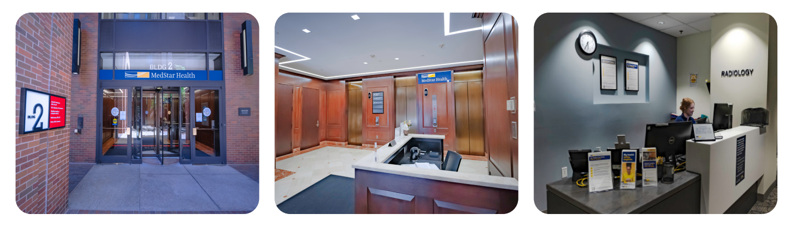
Lafayette Centre Building 2 lobby entrance from the courtyard

Our MedStar Radiology Network offers services on the 8th floor of Building 2. These services include 3-D mammography, CT, cardiac calcium scoring, DEXA, ultrasound, and X-ray on Saturdays and Sundays. During these hours, you may notice fewer associates and security staff at Lafayette Centre.