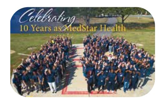
MedStar St. Mary's 10 year anniversary