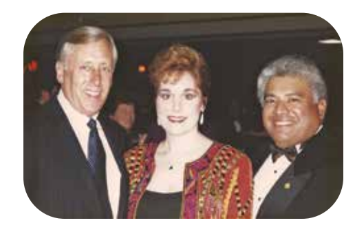
MedStar St. Mary's Gala