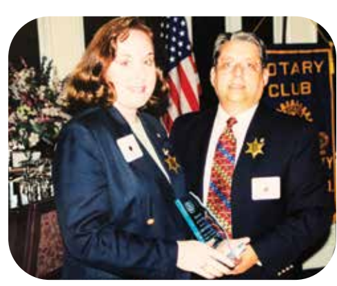
1999 Rotarian of the Year Award