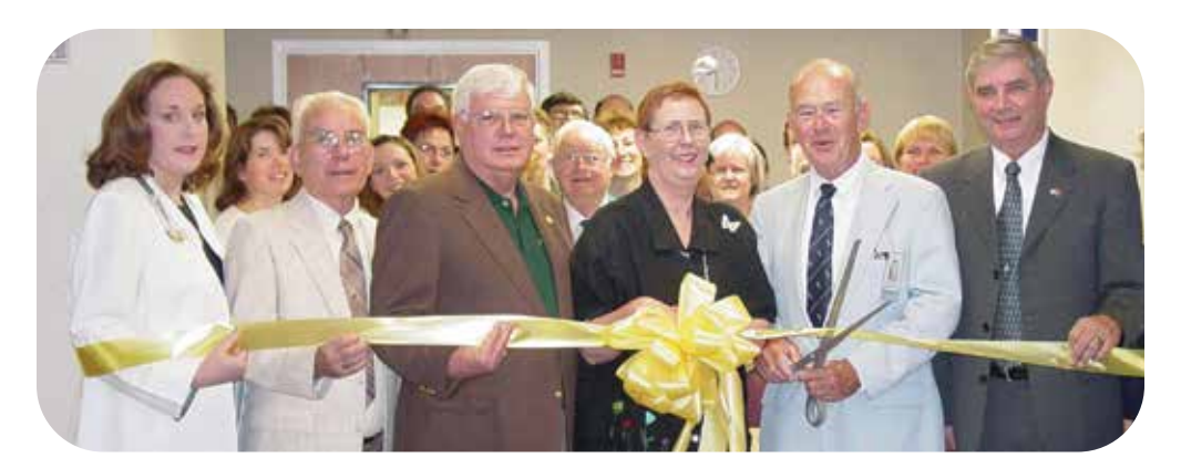
Women's Health & Family Birthing Center ribbon cutting