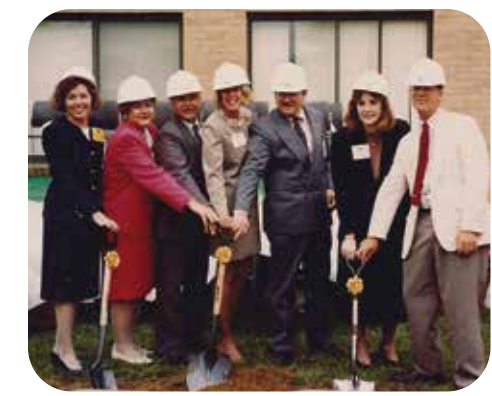
1993 Hospital ground breaking ceremony

6 I Healthy Living Spring 2022 Healthy Living Spring 2022 | 7