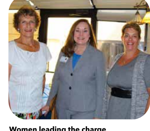
Women leading the charge