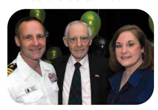
College of Southern Maryland's CEO of the Year