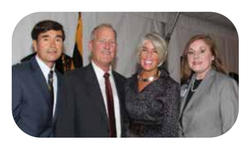
Navy Alliance dinner