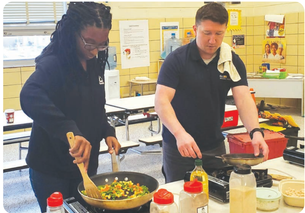
At the Joy of Living's EmpowerHER program, a registered dietitian provides an interactive healthy cooking demonstration for young ladies.