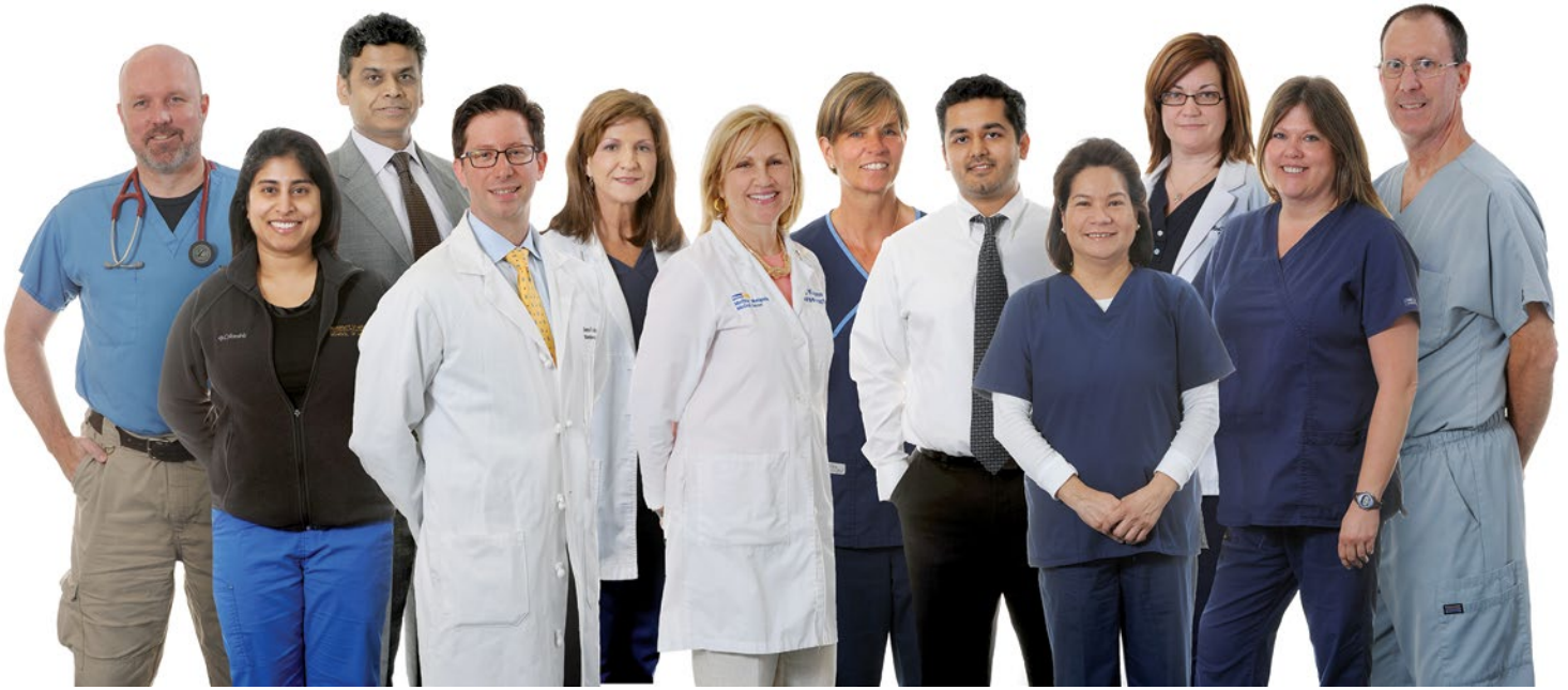
When moments matter in stroke treatment, our stroke team of physicians, nurses, nurse practitioners and radiologists provide highly specialized care to patients.