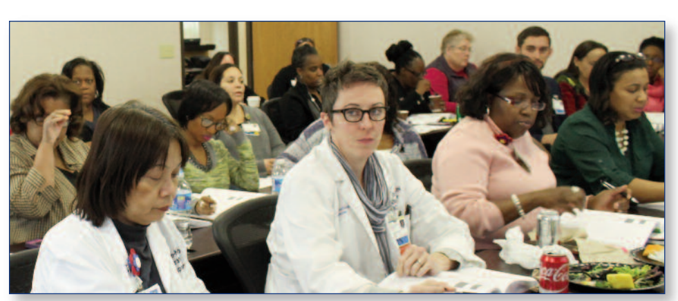
Multiple certification review courses funded by the Center for Excellence in Nursing

Alcohol Withdrawal and CIWA: Clinical Institute Withdrawal Assessment for Alcohol