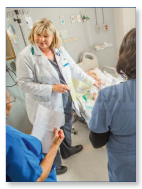
Expanding simulation technology for advancing nursing clinical skills, funded by the Center for Excellence in Nursing